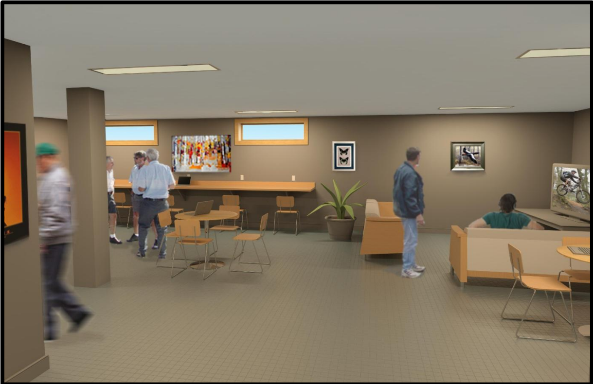
Proposed Interior Offsite Driver Facility