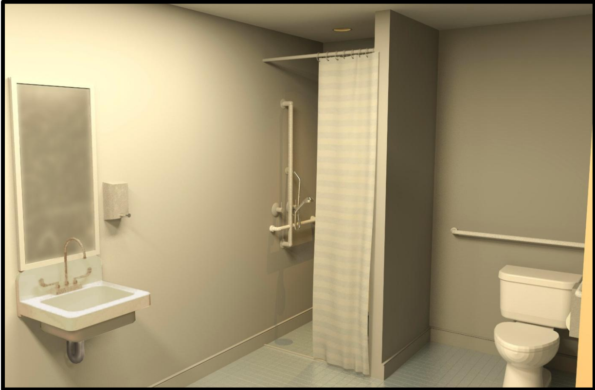
Proposed Restroom and Shower