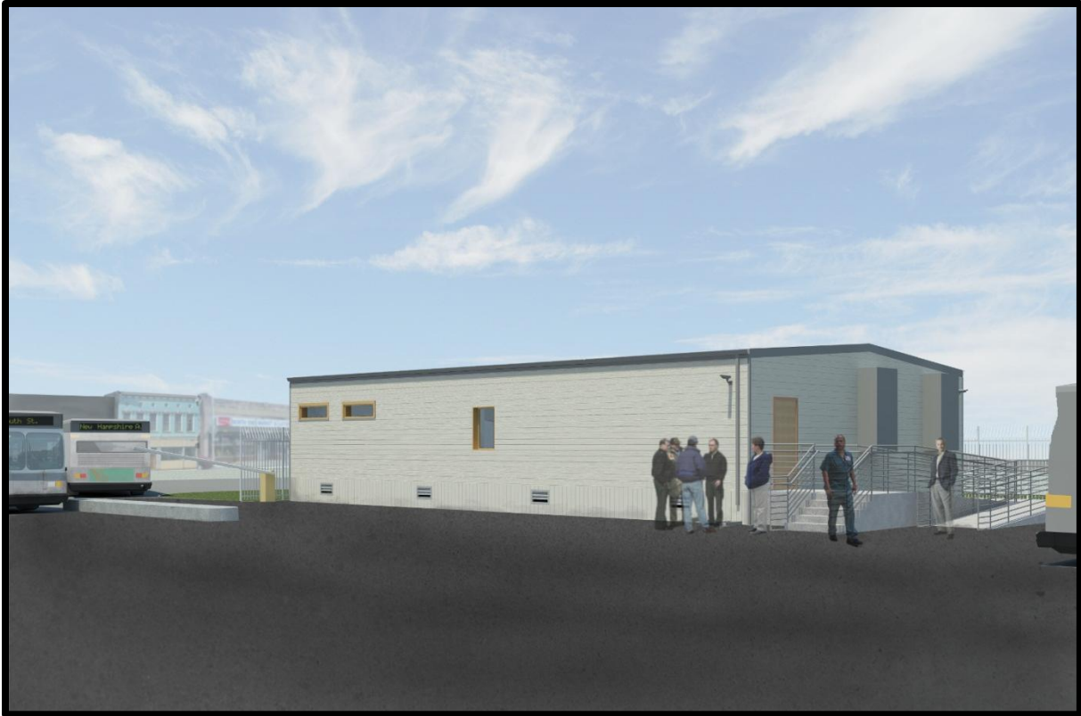
Proposed Exterior Offsite Driver Facility