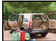
World's Most Expensive Countries to Rent a Car