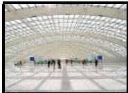
World's Most Beautiful Airports

Enter NOW for a chance to win a DREAM VACATION