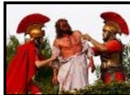
World's Strangest Theme Parks