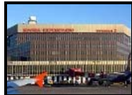
World's Ugliest Airports